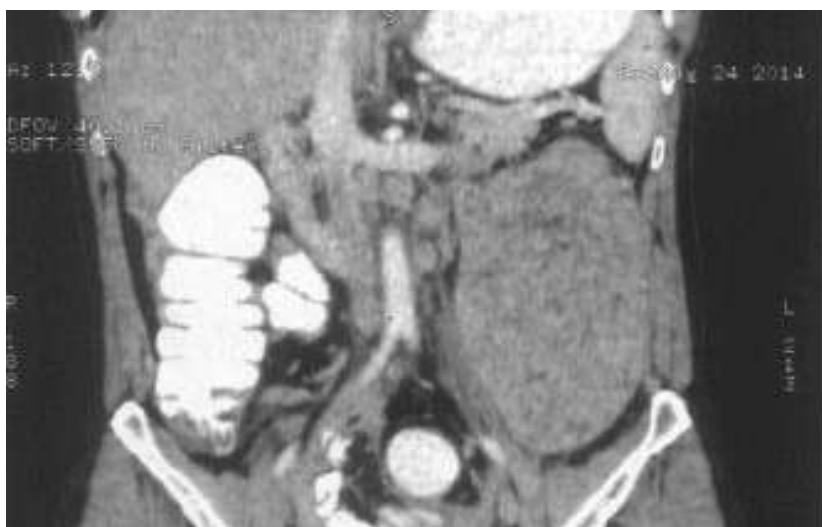
Fig 4: CT Scan - Sagittal section of whole abdomen showing lobulated heterogeneously enhancing mass in left side of abdomen with peritoneal deposits and multiple lymph nodes in mesenteric, retroperitoneal, bilateral left external and internal iliac denoting progressive disease